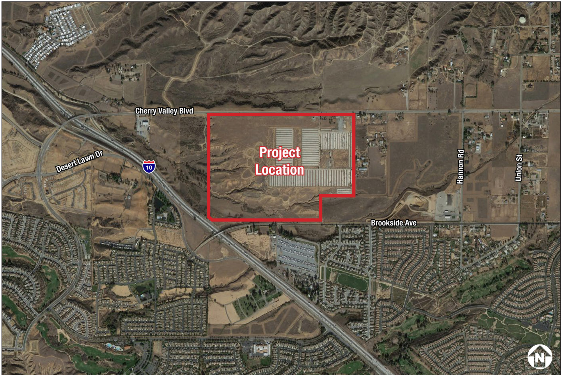
EXHIBIT 1: Aerial Map Beaumont Summit Station Project City of Beaumont, California